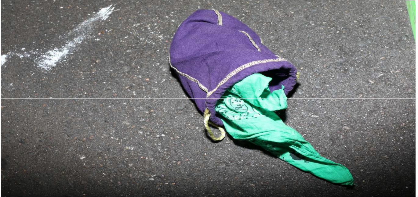
Crown Royal bag recovered at scene containing methamphetamine.