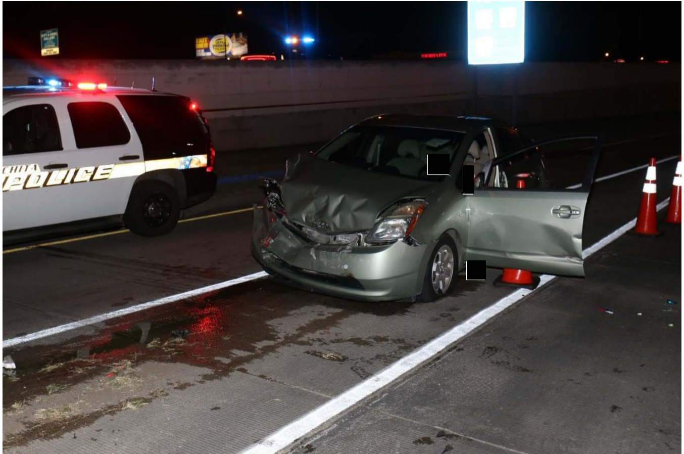
Damage to the eastbound Prius driven by Mr. Garner after the collision with the civilian vehicle, a Chrysler Pacifica. The Pacifica is out of the photo to the left (east). Some damage may also be attributable to earlier impact with the officer's patrol vehicle and the second impact with the blue civilian vehicle in the McDonald's parking lot.