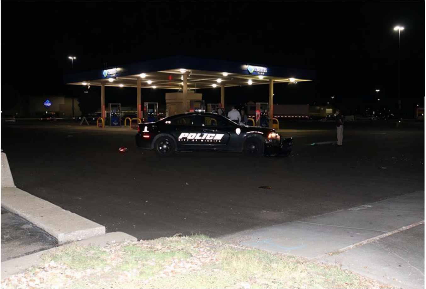
The damaged Wichita Police patrol vehicle at the location of initial traffic stop. In the background, the gas pumps of the Sam's Club are visible. Out of view to the left (west) is the McDonald's restaurant.