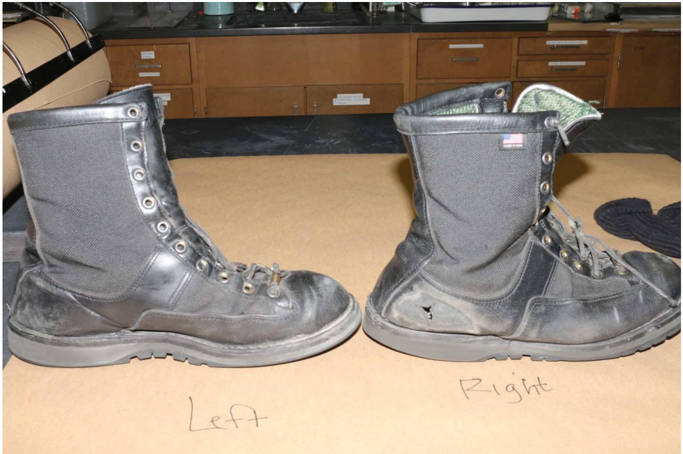
The officer's boots showing significant wear to right heel above the sole.