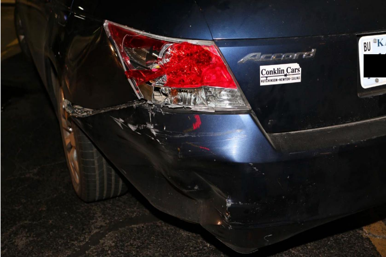
Blue Honda struck in McDonald's parking lot.